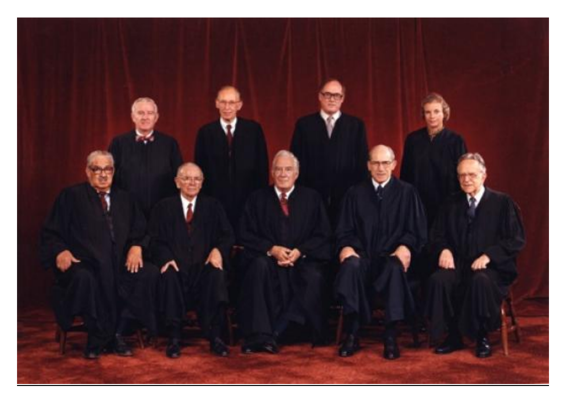
Berger Court, 1970